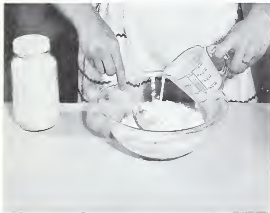
N-39870--For muffins, combine eggs and water with basic mix.